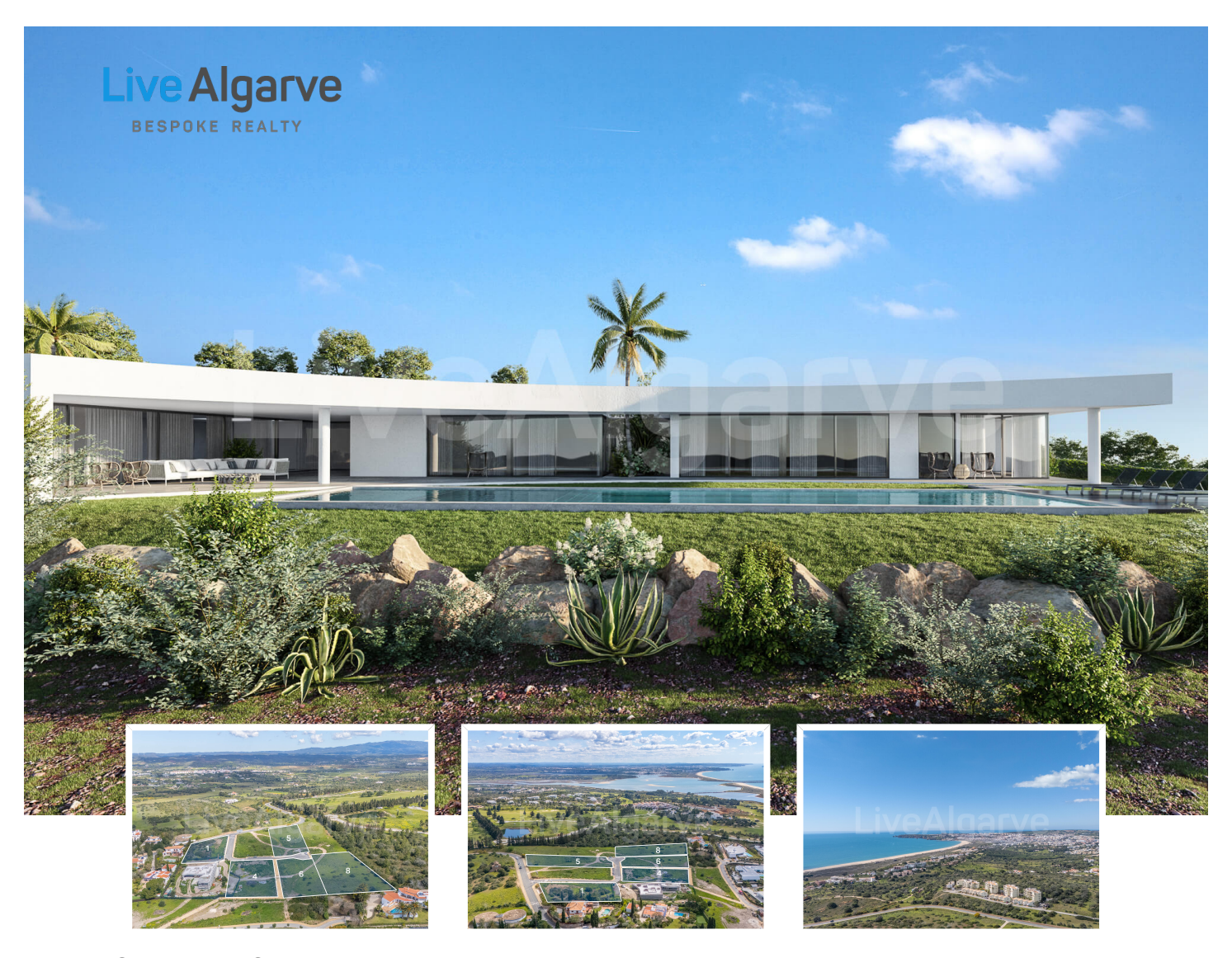
SEA VIEW | Striking Building Plot with Luxury Villa Turnkey Project at Meia Praia - Lagos